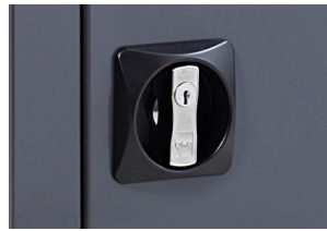
2-Point locking system