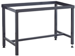
Optional stands available